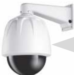
PTZ Speed Dome