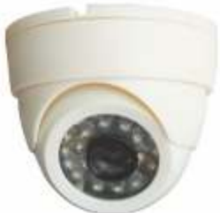
IR Dome Camera