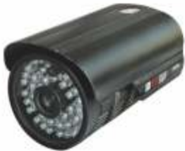
IR Bullet Camera