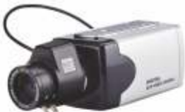
C Mount Camera