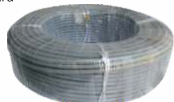
CAT -6 Cable